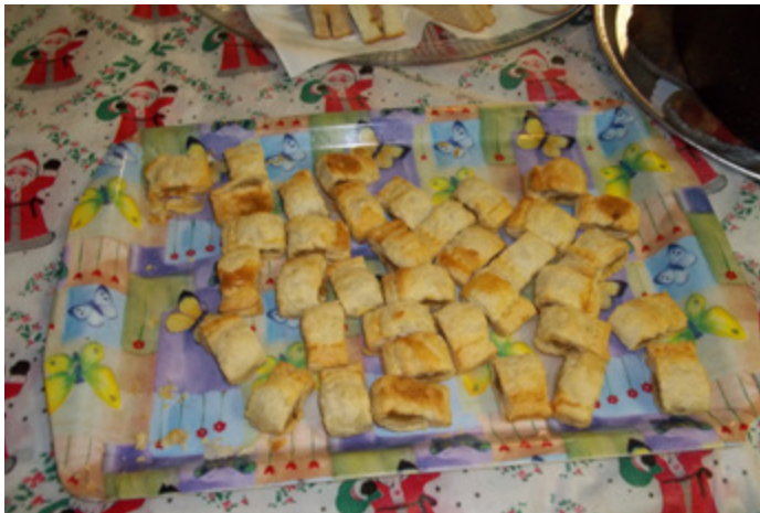
Mini sausages in a bun