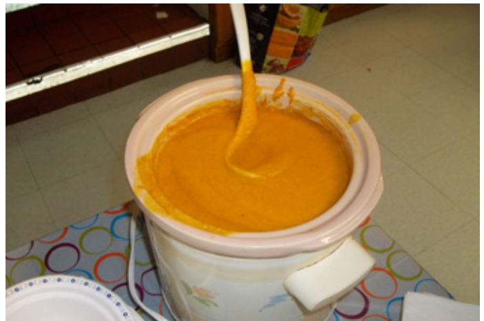
And of course Jon's famous sweet potato carrot soup.