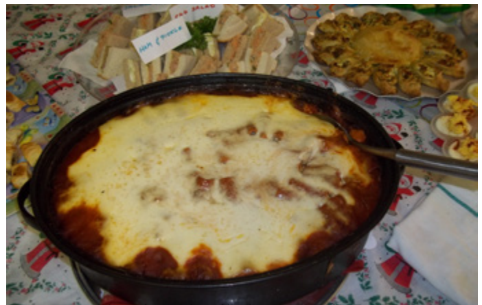
Sandwiches, devilled eggs and rigatoni.