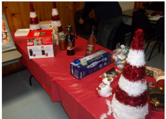
A shot of the gift table.