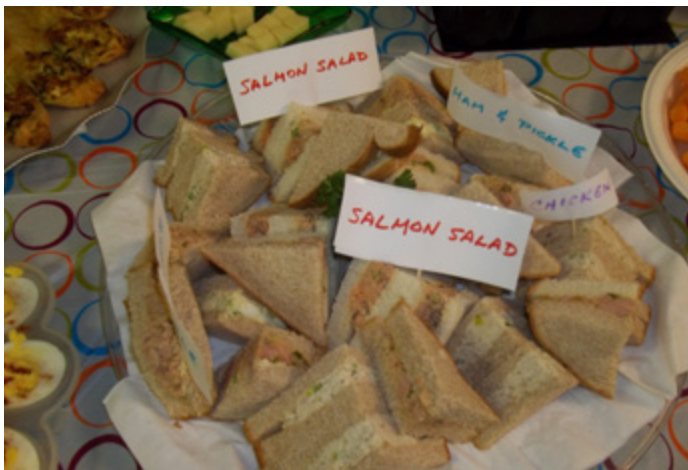
Tons of sandwiches