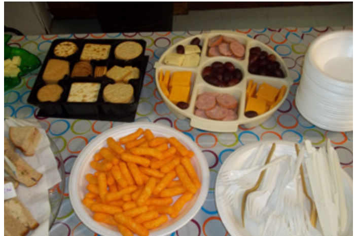
Cheese, crackers and cheesies oh my!