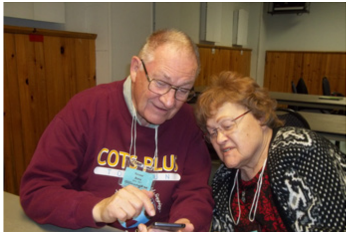
Nope...he's just programming her phone.