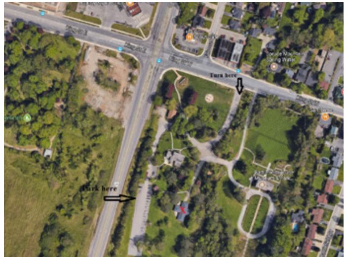
Directions to the park for July. Fist right after Highway 20. Keep to the right and park by all the cars. The Pavillion is in sight.

The video is about a married couple talking about life. The wife asks questions of her husband as to what he would do if she passed away. Would he remarry, would he give the new wife her car, would he take down her pictures, would he give his new wife her golf clubs. He answers all her questions logically until it came to the golf clubs and then he slipped up letting her know that he was seeing someone else now.