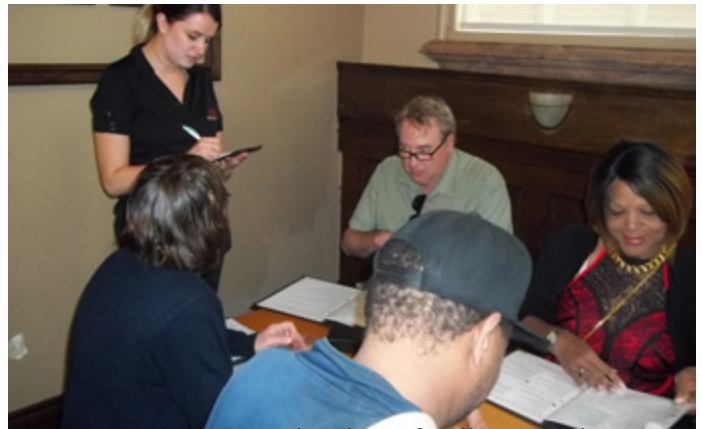
And the stragglers have finally arrived.

We'd like to thank everyone who submitted their videos and congratulations to those who have won. Well done everyone!