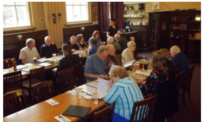
Group shot with more coming