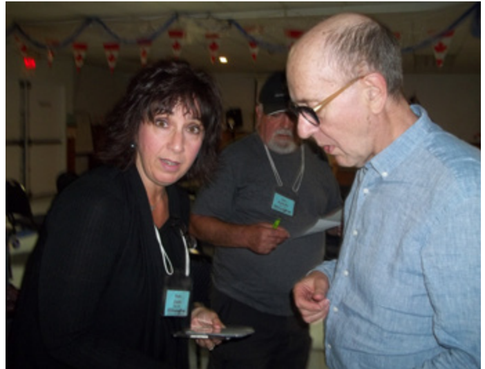
Never approach Paula with your headlights on.