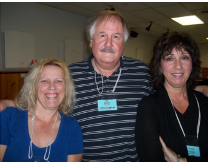
Sometimes even the photographer has to be photographed