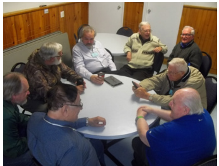
Everyone arrived but no one brought the cards or poker chips