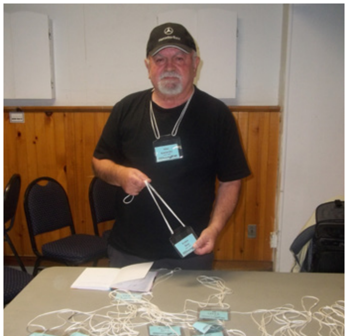
Miro decides he wants to slingshot the badges to everyone rather than hand them out