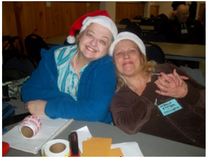
Wifey 1 & 2 together again