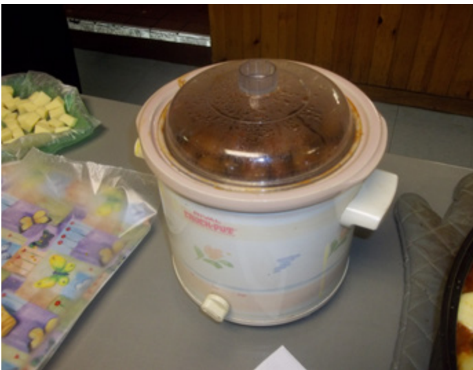
Jon's...hey wait that's not sweet potato carrot soup!!!