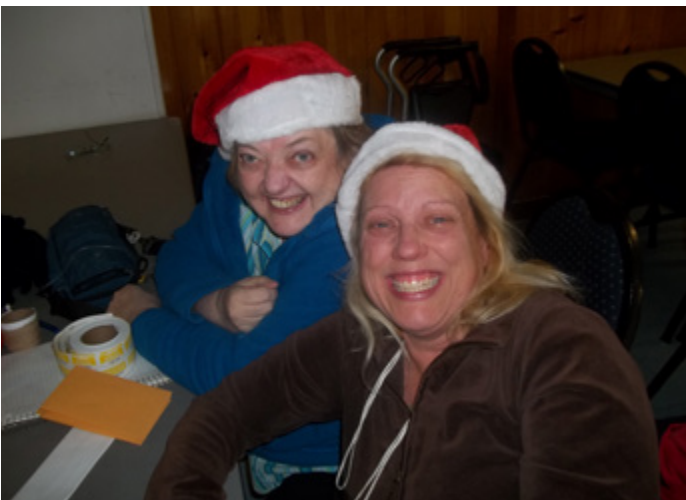
They're up to something and they won't say what.