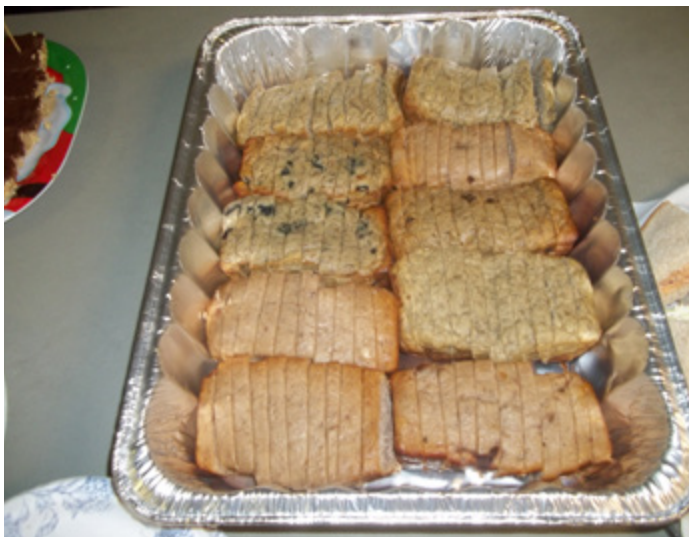
Just a few banana breads from Cathy