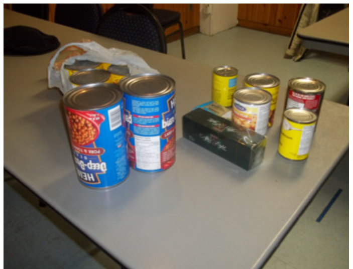
Someone brought in a upside down drunken can of beans