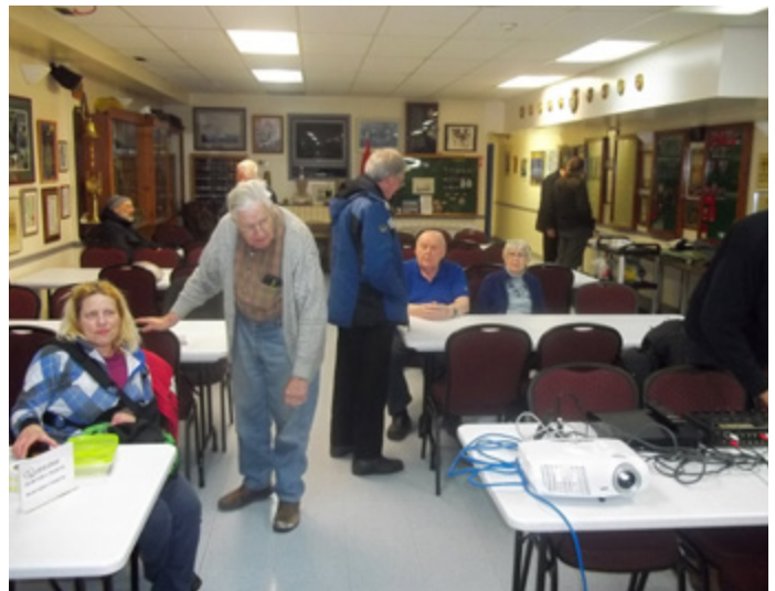
A new location and no one knows where to sit.