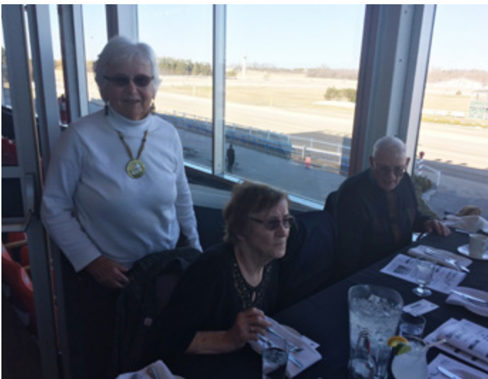
My future's so bright, I gotta wear shades