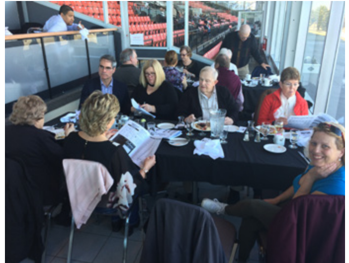
Bring on the buffet