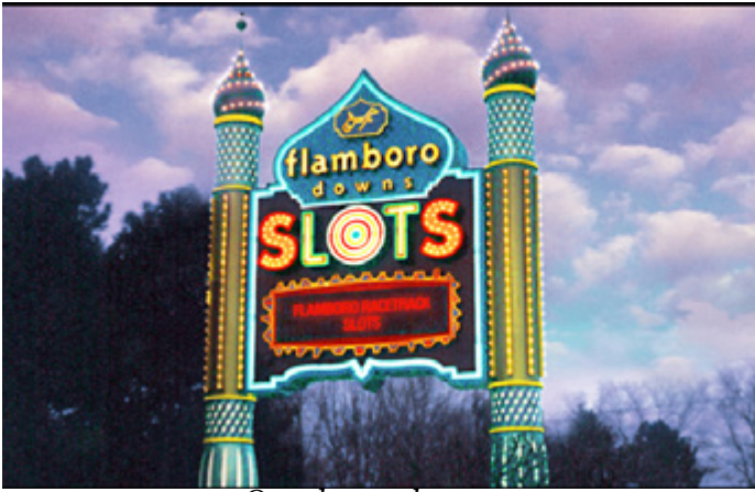
Our day at the races