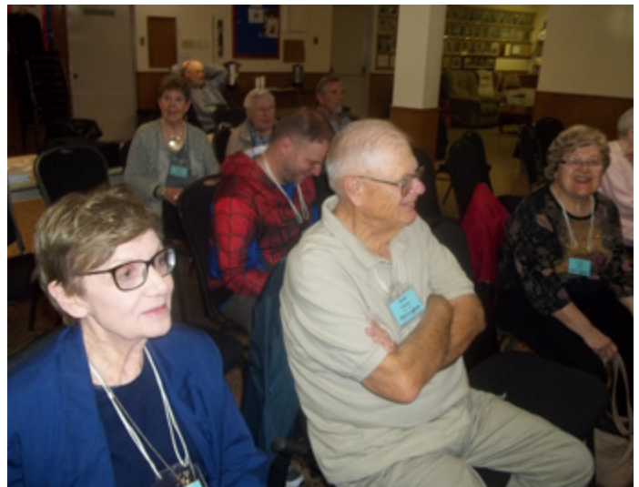
No one in the audience even noticed that Spider-Man removed his mask