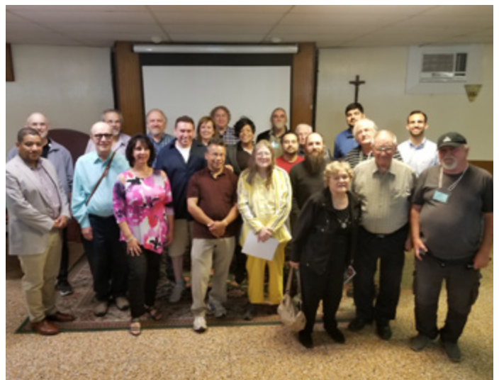
Group shot of almost everyone in attendance