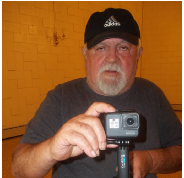
If it moves, Miro will videotape it.

Well done everyone!! See you all next month Happy filmmaking everyone.