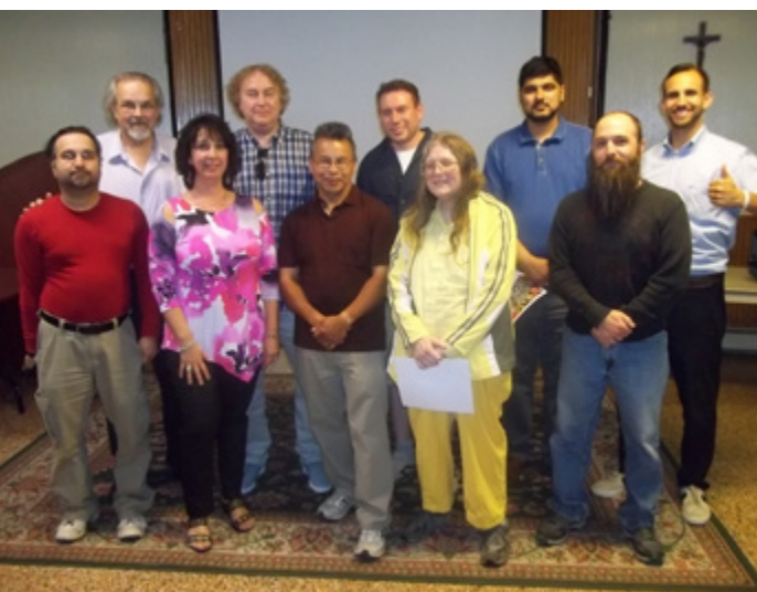
Good to see members of the Buffalo film-video club as well as past current Presidents of our club