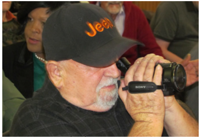
Miro has his eye on everyone