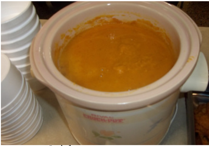
Jon's famous sweet potato soup