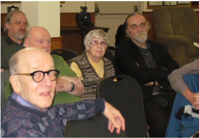
That moment Jim realized he's on camera