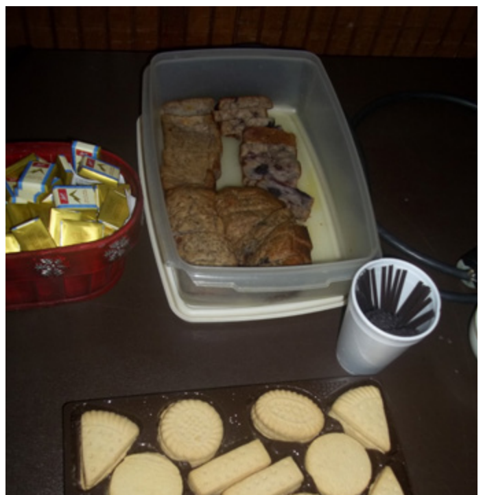
Cookies & banana bread mmmmmmmmm