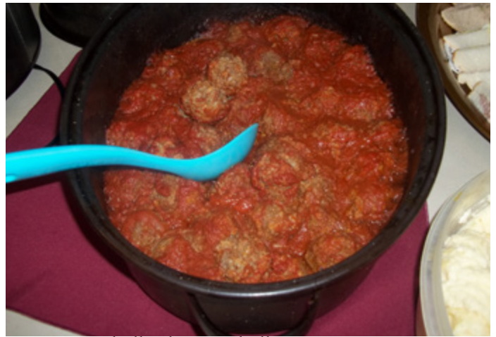
Porcupine balls aka meatballs & rice in tomato sauce