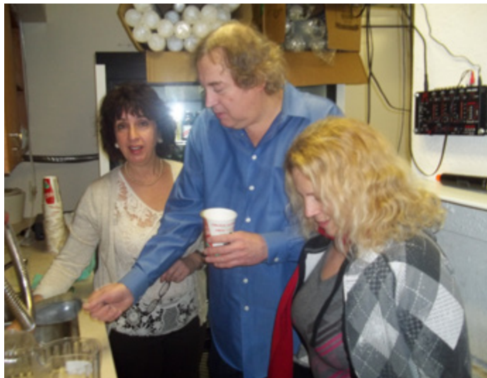
One bartender, two bartender, three bartender...oops