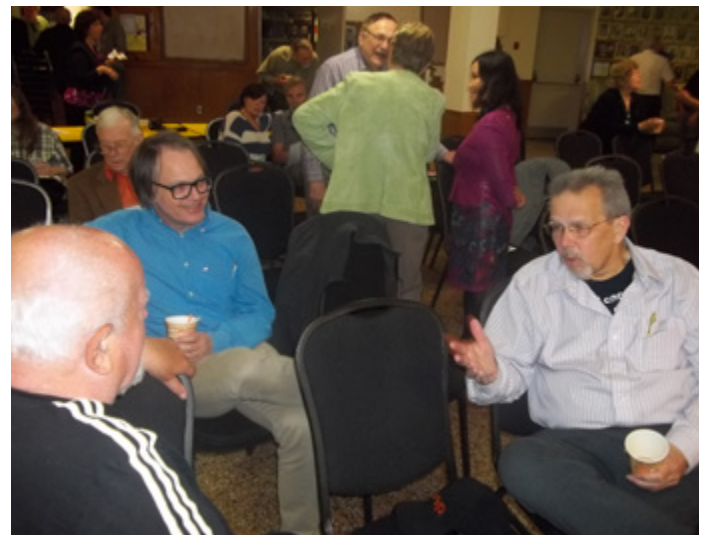
That moment when Jon realizes there is no 50/50 draw.

See every one next month. Same bat time, same bat channel