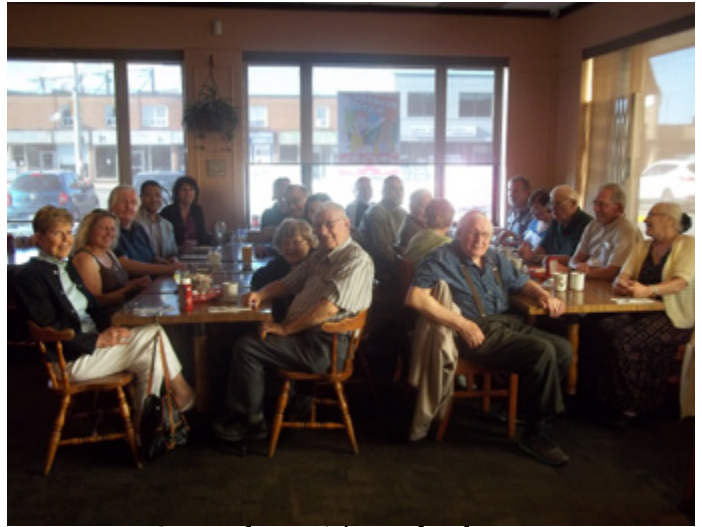
Group shot at The Bedrock Bistro

A documentary on several memorials about the Titanic. One in Canada & the other in Ireland.