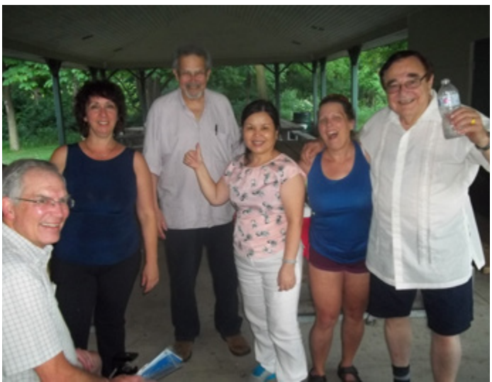
And who's missing here?