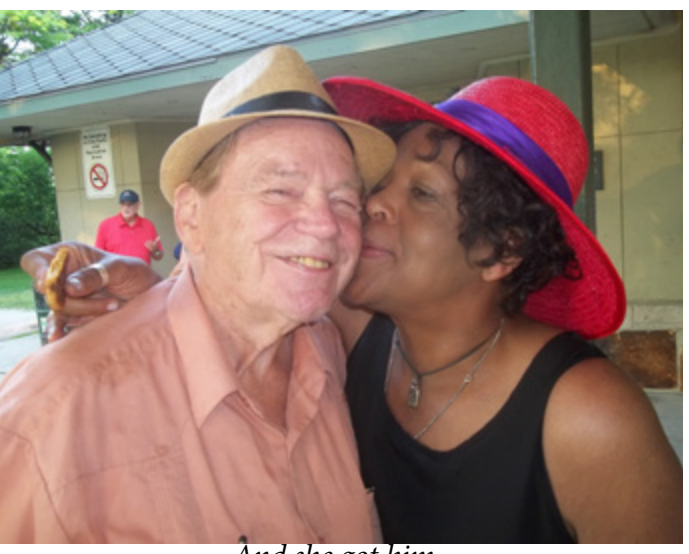
And she got him.