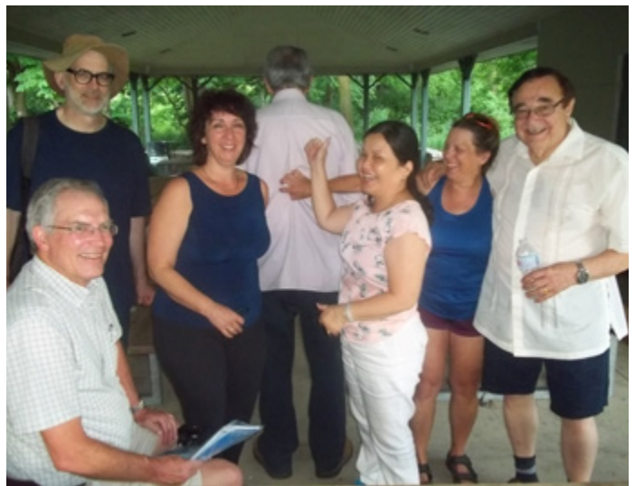
And what's wrong with this picture?