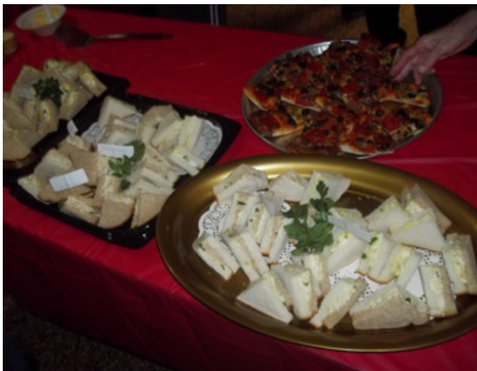
Sandwiches & pizza