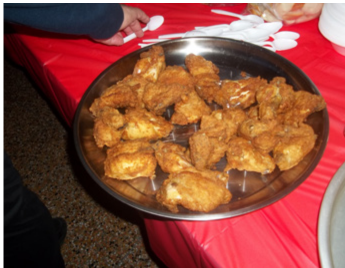
2 buckets of KFC