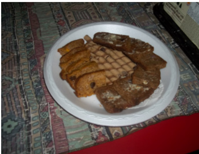
Cake & cinnamon sticks