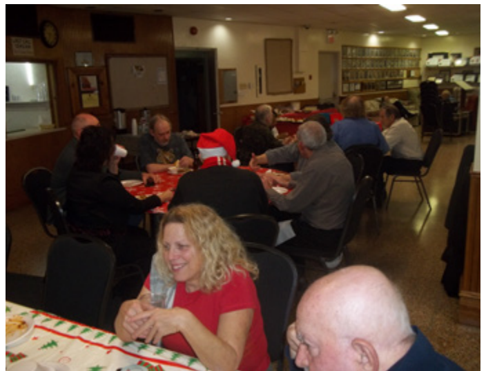
Overall crowd shot