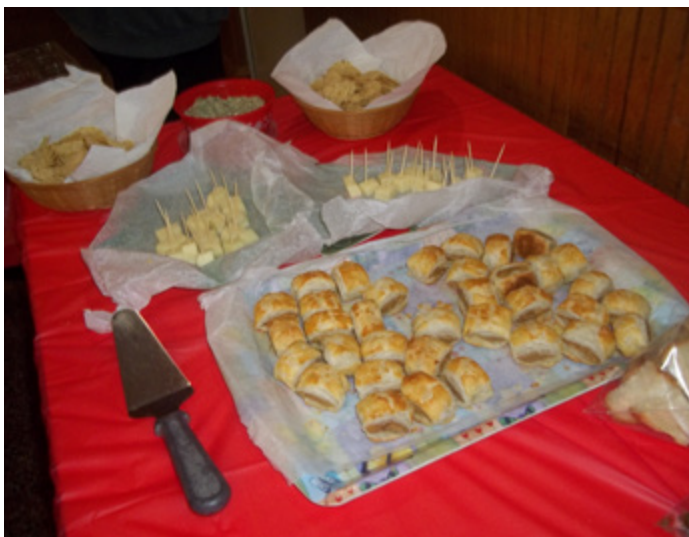
Pigs in a blanket & cheese