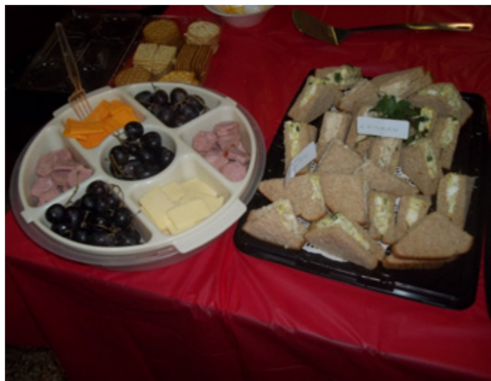
Sandwiches, cheese, keilbasa & grapes