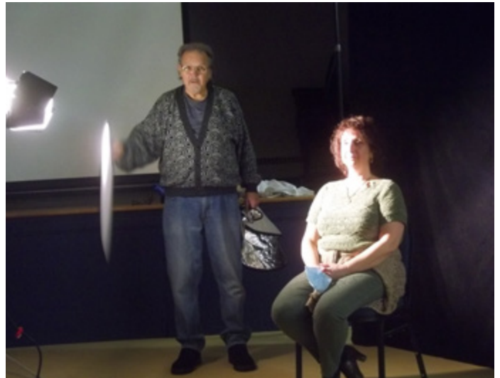
All you want to do is tick? We have ways of making you tock.