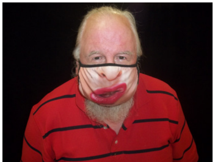
Why you should never buy a Mick Jagger mask off of wish.com