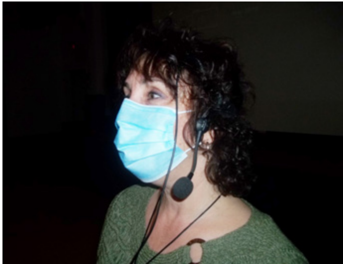
May I take your order? Would you like fries with that?