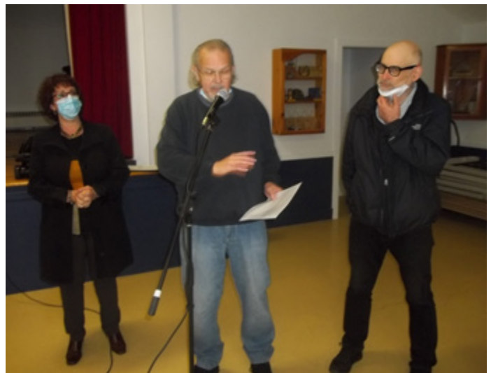
Oh three sad souls oh me oh my...