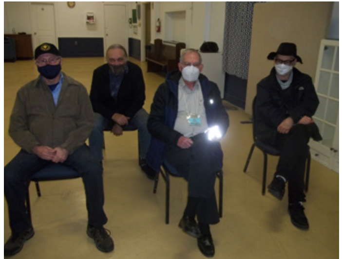
No one noticed that Rick is actually Doctor Who starting to regenerate.