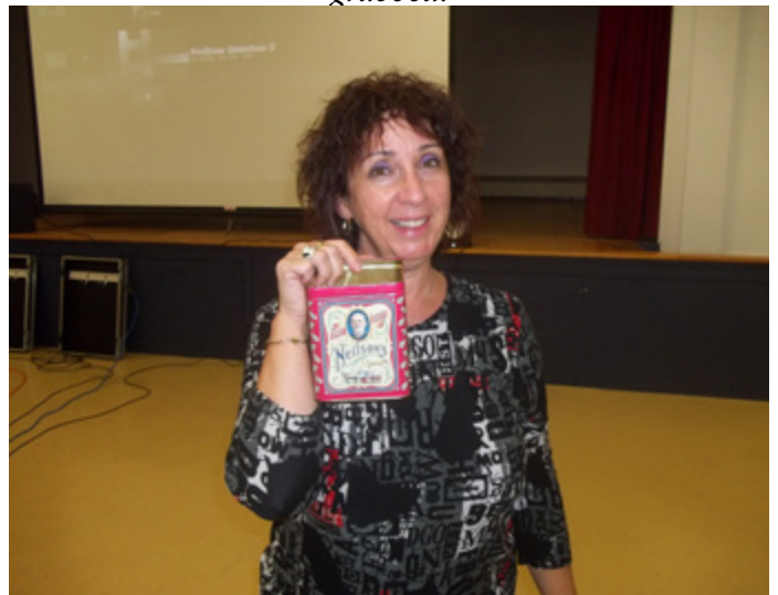
Guess who won the 50/50 draw? Guess who didn't?

Hopefully everyone will go out & shoot some videos.