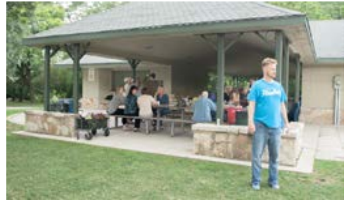
JR stands guard against dangerous rogue squirrels.