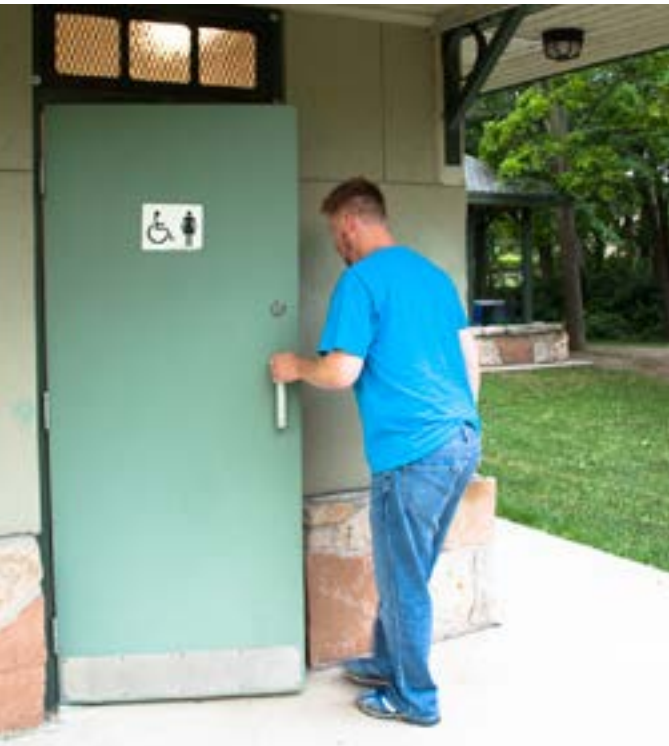
Clearly JR doesn't remember his men/ women washroom symbols