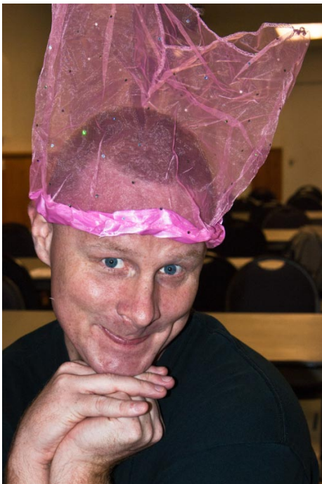
There are no words in the English language to improve this image.