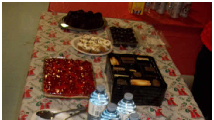
The dessert table

They may be gathering dust, but we'd love to see them. If you have any of your video productions that are greater than 20 years old, bring them in and show them at a club meeting. Make sure they are playable on the club's system: either DVD, Blue-ray, or on a memory stick.