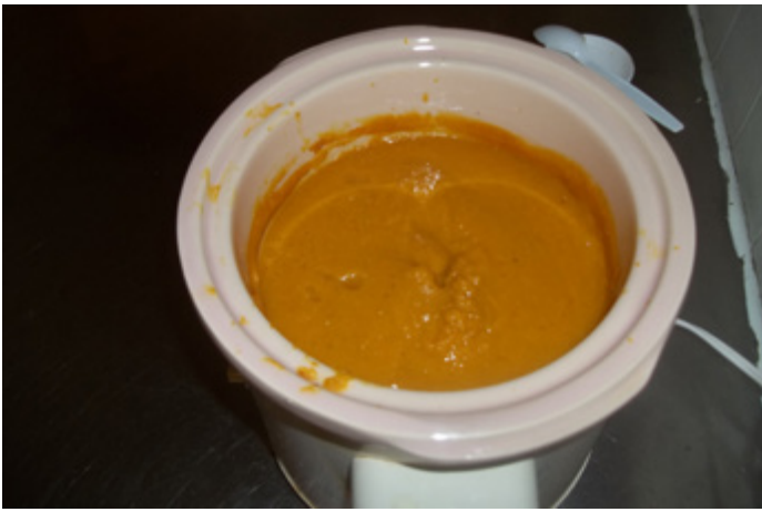
Jon Soyka's famous sweet potato & carrot & apple soup