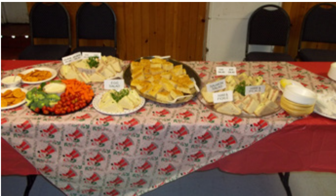
Sandwiches & veggies