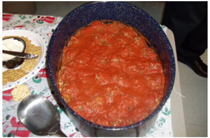
Those are some bigga meataballs!!!