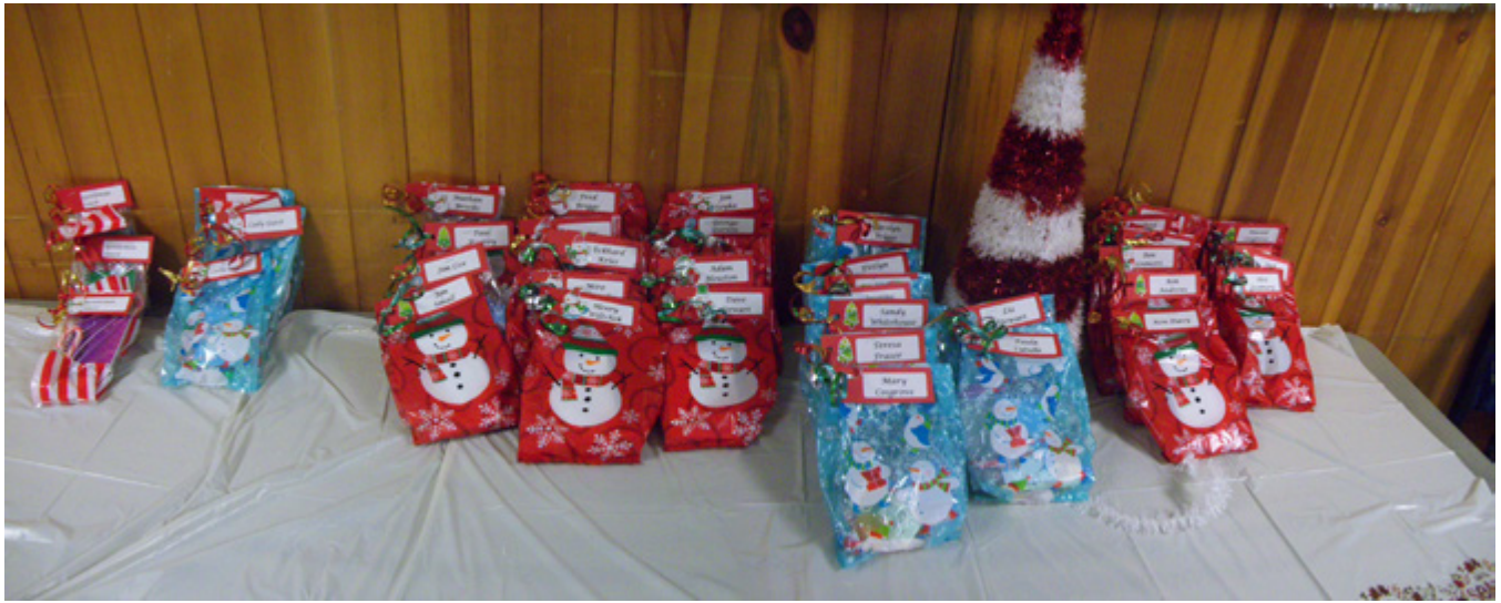
All kinds of gifts for good little boys & girls.