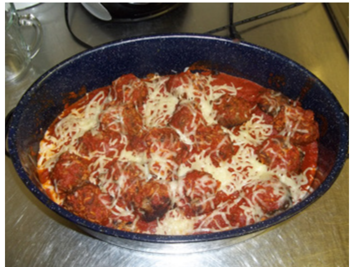
Meatballs & rice with cheese AKA porcupine