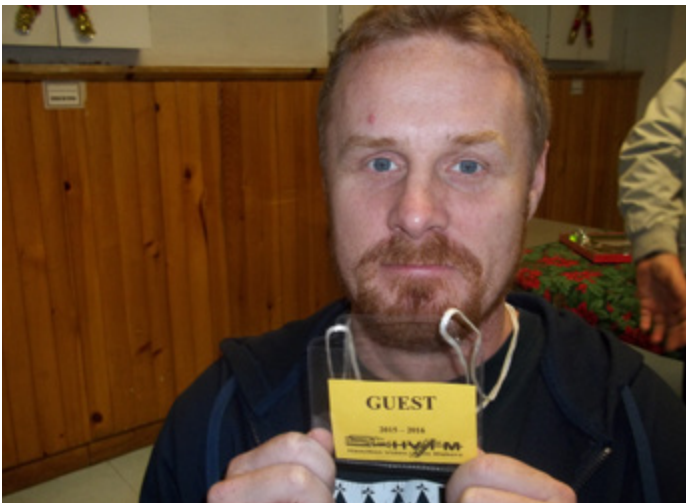
JR realizes that G-U-E-S-T does not spell JR