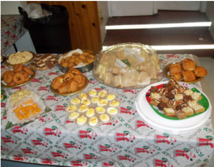
Sandwiches, eggs and donuts oh my