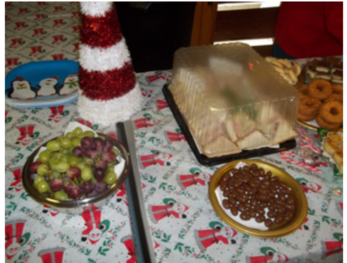
Nore sandwiches & chocolates