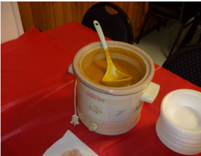
Jon Soyka's famous sweet potato carrot soup....NOT squash.