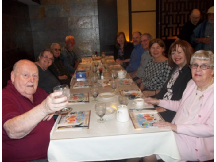
A great dinner at King's Buffet.