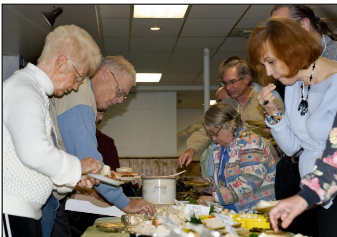
So many faces, so many choices, so much food.