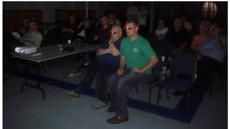
Don't they remind you of a bunch of nerds. Broken glasses held together with white tape in the centre.