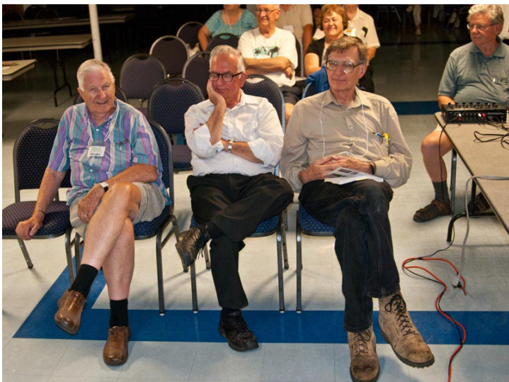
Now it is not just a question of which leg to cross, but also what color shoes do you wear to the club.