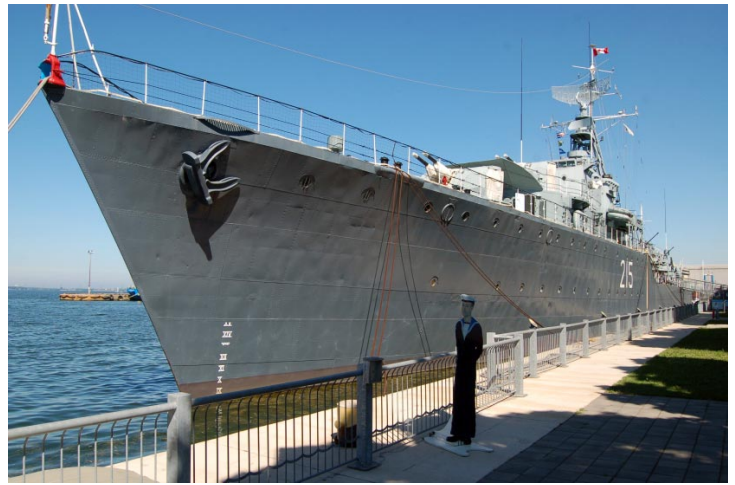
The government, due to cutbacks, replaced a real sailor with this wooden cutout. We think the boat is real.