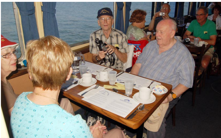
HVFM members wait for their food on the August 2011 cruise aboard the Hamilton Harbour Queen.