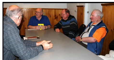
Harolds boys sit around waiting for him to deal the cards.