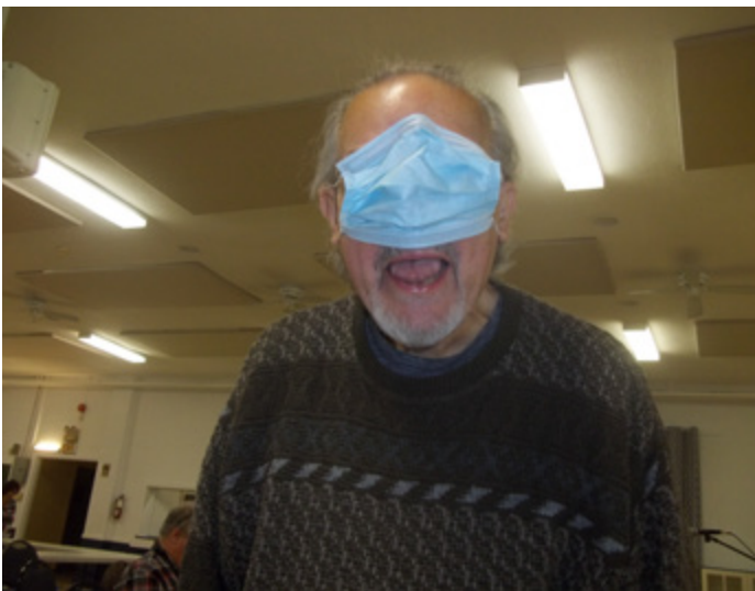
The Strange Loner can't find his way around.