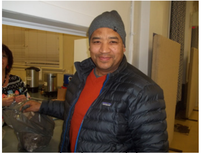
Who is that man in the hat?