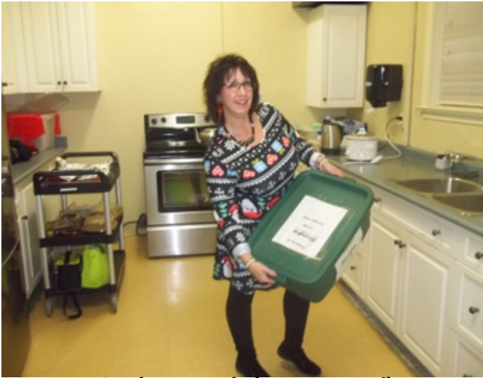
Our hostess with the mostest stuff.