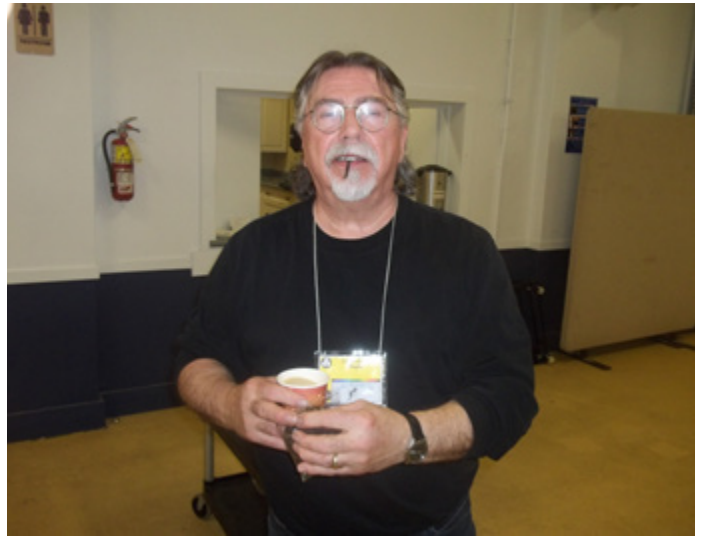
Now where did I put that stir stick.