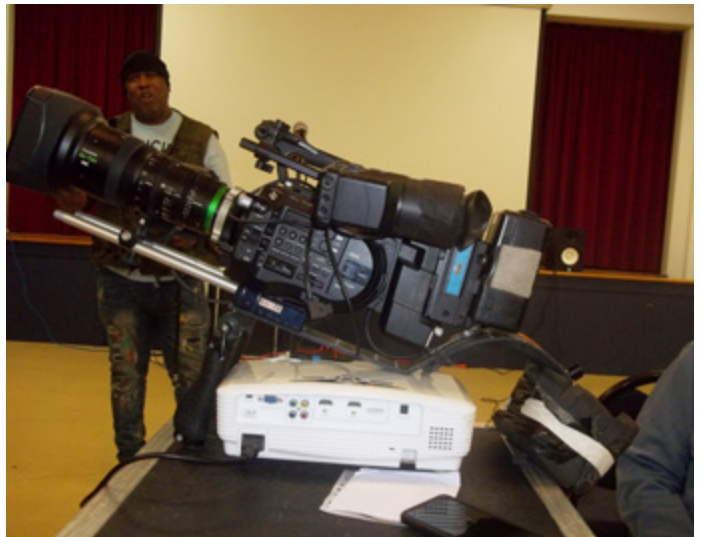
Just a wee little camera.

Keep the videos coming. See you all May 1st Same bat time Same bat channel