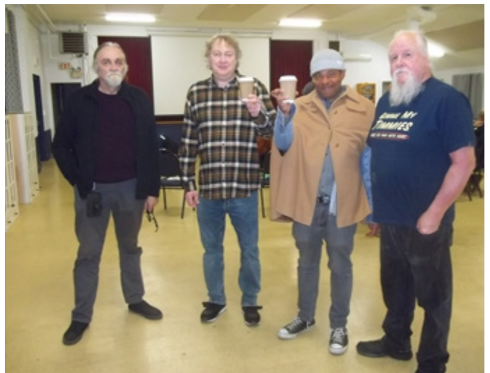
Real men don't hold cups, we wear beards.