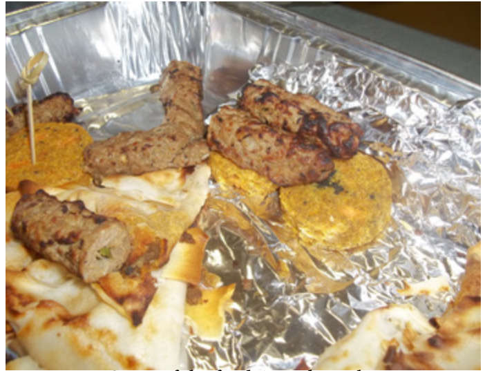
Some of the food Anne brought.