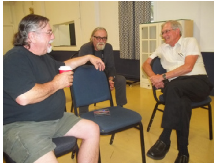
No one knows why the CD wants to play musical chairs.

Meetings held the 1 st Monday every month at the St. Matthew's Anglican church – 126-136 Plains Rd E Rd., Burlington, ON