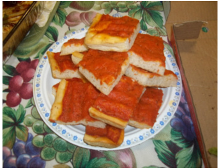
Mmmm Roma pizza