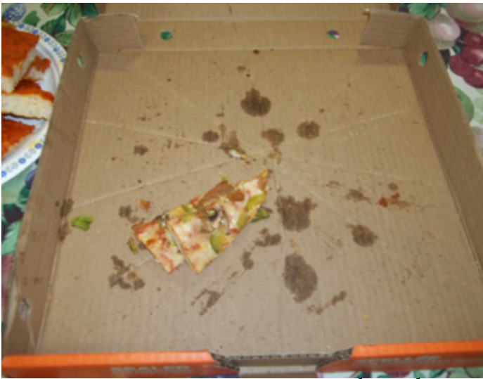
Pizza Pizza went gone, gone, quick, quick