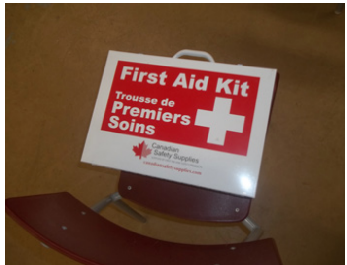
Ok, did someone think we needed a first aid kit?

A woman asks a man what would he do if she passed away only to discover he's cheating.