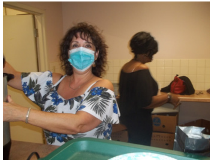
Who was that masked woman?

Meetings held the 1 st Monday every month at the Faith United church – 842 Main St E., Hamilton, ON