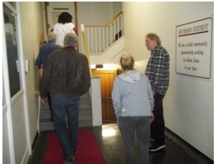
Starting the tour