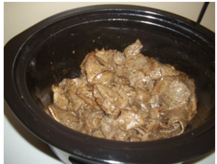
...and roast beef

Meetings held the 1 st Monday every month at the Faith United church – 842 Main St E., Hamilton, ON