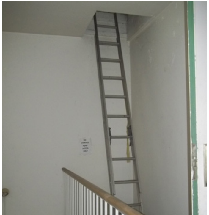
Quasimoto is up there.