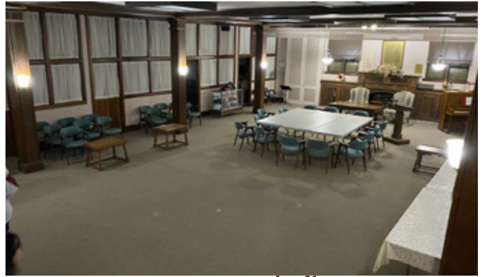
Interesting room for filming

Keep the videos coming. See you all next month, Feb 5th Same bat time. Same bat channel