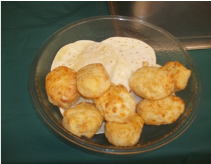
Tortillas & biscuits