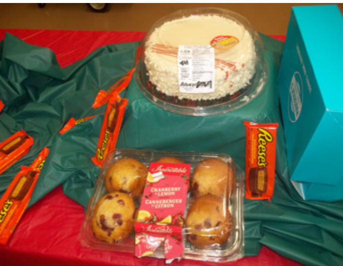
Cake & muffins