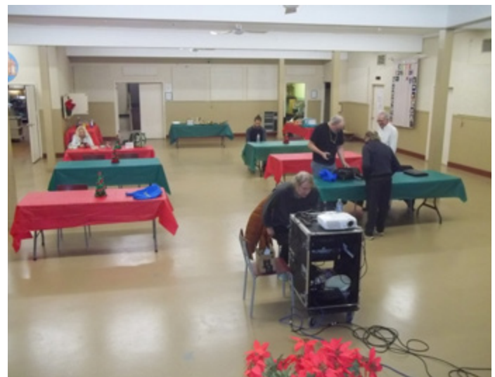
Not a big group so lots of food left over.