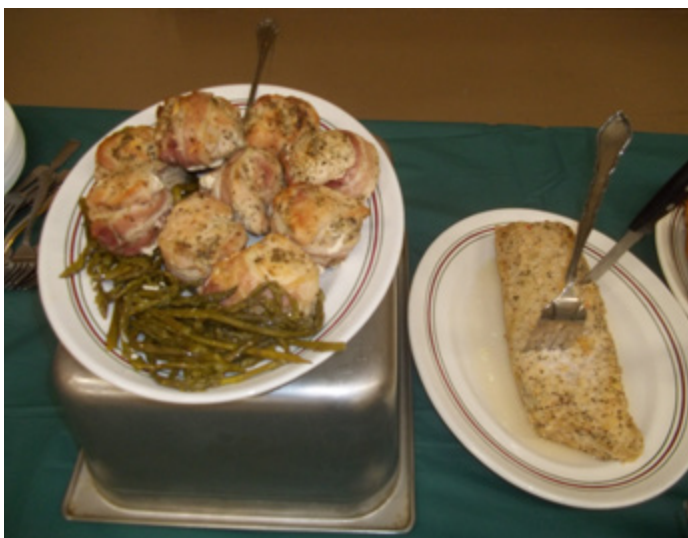
Chicken wrapped in bacon & pork loin