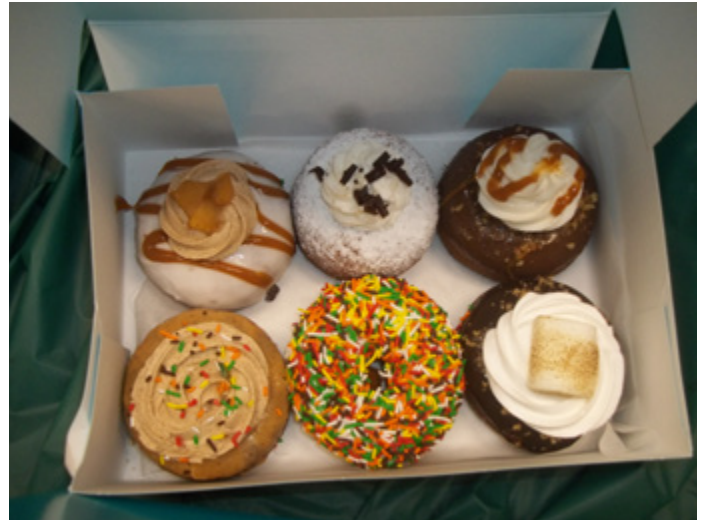
Mmmm more donuts