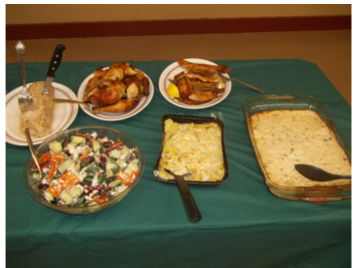
Pork loin, turkey legs, salmon, Greek salad, scallop potatoes & bacon potatoes