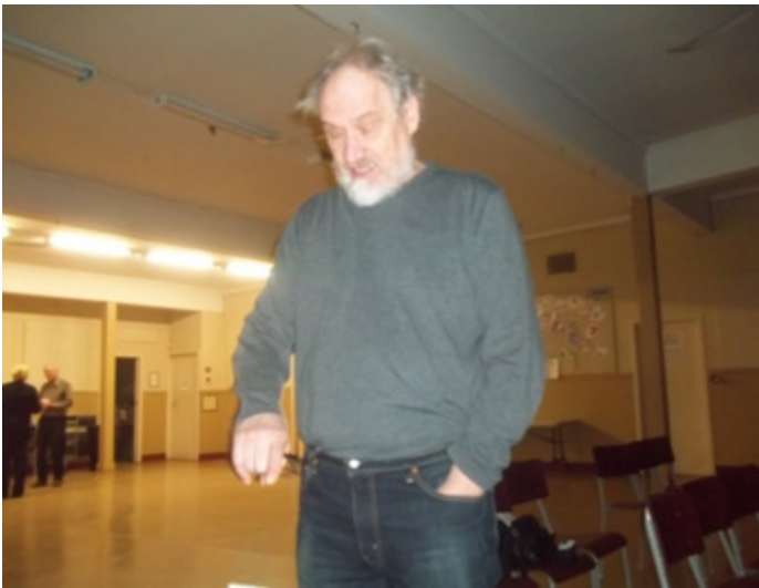
Eenie, meenie, miney moe. Which ticket do I want?