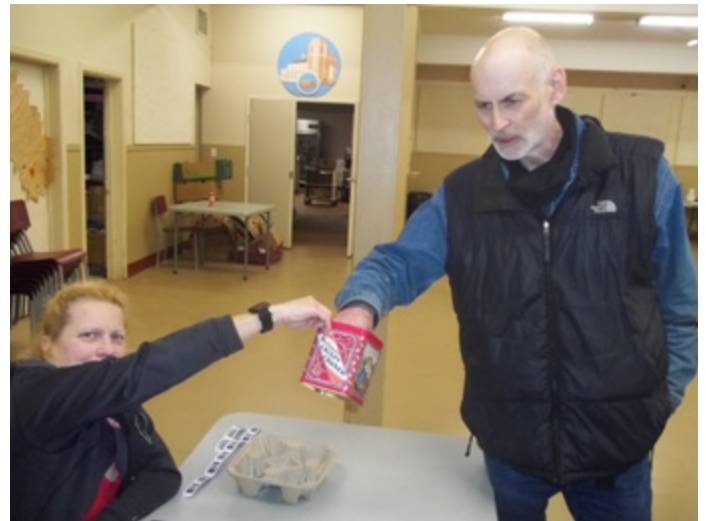
And the winner is....