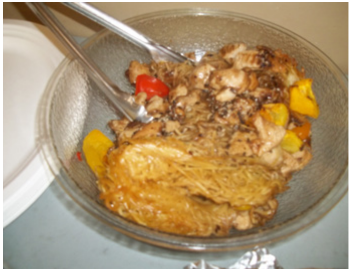
Chicken chow mein