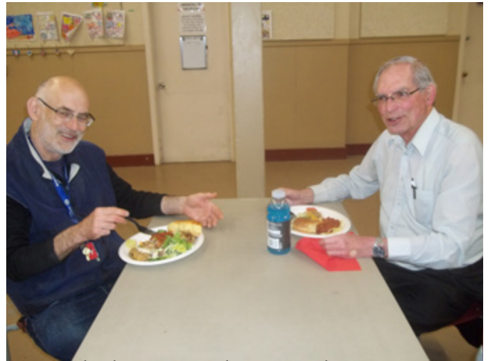
I caught them again. They just can't seem to eat in peace.